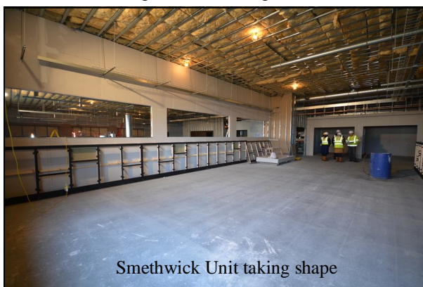
Smethwick Unit taking shape